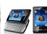
In pics: The best navigation phones