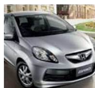
Honda rests hope on new Brio